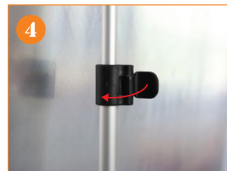
4. Open and close the clip to adjust the height of the pole.