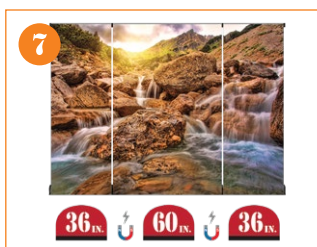
7. The magnetic base end caps and top profile of Le Plus allows you to connect multiple units to create a continuous display.