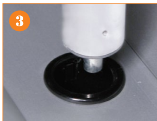
3. Insert the pole into the base.