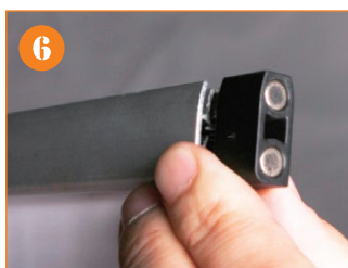
6. Replace the regular end caps with the magnetic end caps.