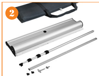
2. Take out the hardware and pole from the bag.