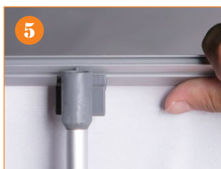
5. Attach the top bar on the top clamp profile.