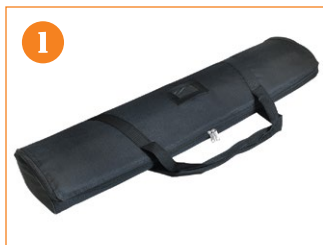
1. Le Plus Black Padded Bag