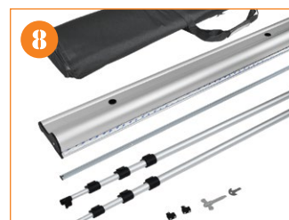
8. Le plus 90 is also available if you want to create an accent backdrop for events or trade show